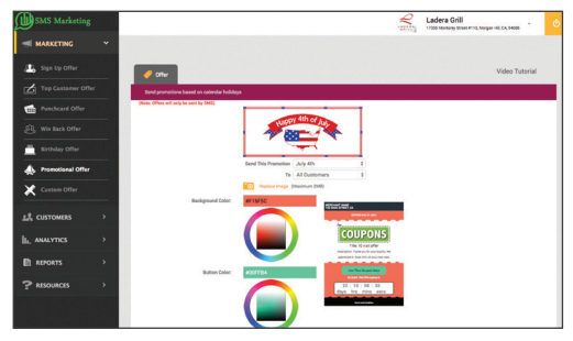
Automatically send holiday promotions directly by SMS to all your customers or only to your favorite customers

Dashboard shows a snapshot of your marketing performance and loyalty revenues